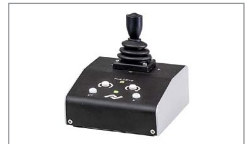
Motorized X-Y adjustment and component rotation.