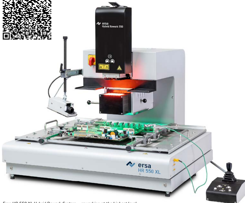
Ersa HR 550 XL Hybrid Rework System – reworking at the highest level.