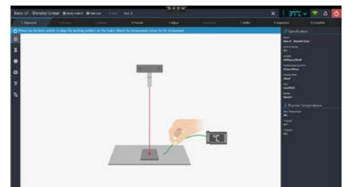
HRSOft 2 with integrated user guidance.