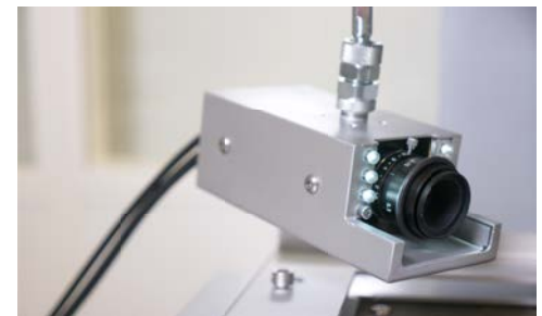
Optional reflow process camera.