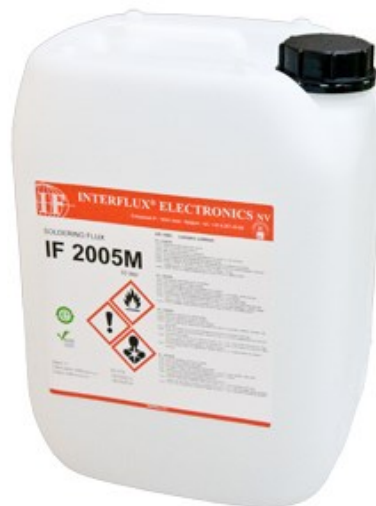
Products pictured may differ from the product delivered

IF 2005M is also available in refillable flux pens for hand soldering.