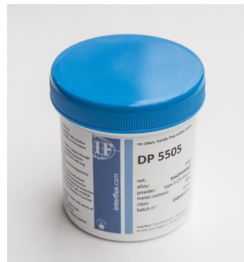
Products pictured may differ from the product delivered

DP 5505 SnPb(Ag) is classified as RO LO according IPC and EN standards.