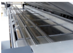
Optimized Heat Transfer, minimized \Delta T , Zone Separation