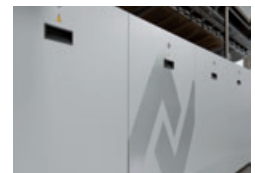
Only high quality materials are used, also in the basic system.