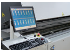
ERSASOFT: User Friendly Machine Control