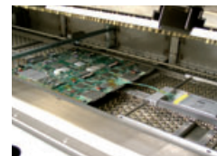
Integrated Bluetooth wireless module; Data transmission and display in real-time.