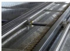
Low-mass center support