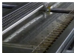
Low-mass center support