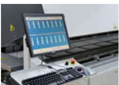
ERSASOFT: User Friendly Machine Control