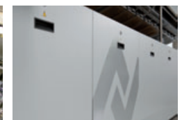
Only high quality materials are used, also in the basic system.