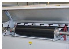
Maintenance-friendly condensation management with cleaning granulate