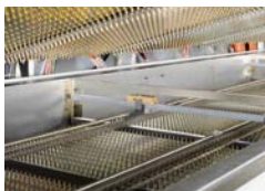
Process tunnel, tested for tightness, guarantees long-term stability