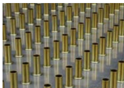
Improved heat transfer with high density Ersa multijet