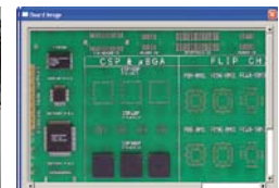
Ersa Autoprofiler: Easy offline profiling for highest machine uptimes.