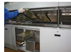
Quick and easy servicing through excellent accessibility