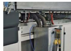
Maintenance "On-the-Fly" continues to operate while the condensation management system is being cleaned